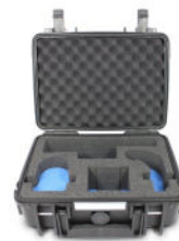
SA 147 Waterproof Carrying Case for Dosimeter and Docking Station