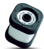
SV 34 Class 2 Acoustic Calibrator 114 dB at 1 kHz