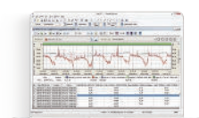
SvanPC++ EM Post-processing software