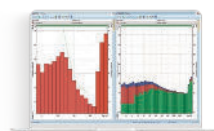
SF 974_3 1/1 & 1/3 octave analysis option