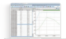
SF 974_8 Rotation measurement option without Laser Tachometer