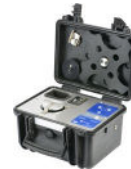
SV 111 Vibration Calibrator