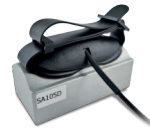
SA 105 Calibration Adapter to SV 105 and SV 107 Accelerometers