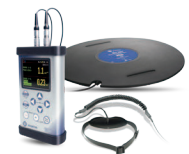
SV 106D Six-Channel Human Vibration Meter