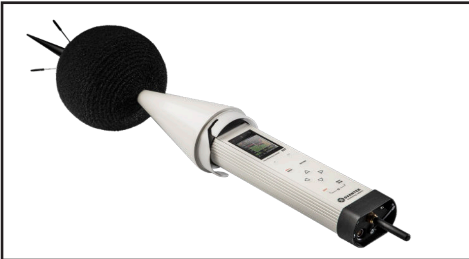
SV 307 - first ever class 1 noise monitor with MEMS microphone