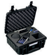
SA 72 Waterproof carrying case