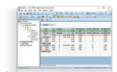
SF 973A_20 STIPA measurement