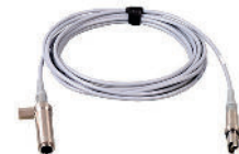
SC 91A Microphone Extension Cable