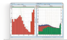
SF 971A_P1 Package 1/1 & 1/3 octave and audio recording