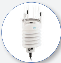
SP 275 Weather Station based on VAISALA module