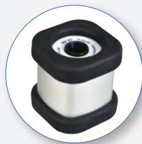
SV 36 Class 1 Acoustic Calibrator 94 dB / 114 dB at 1 kHz