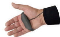
SV 105F Tri-Axial Hand-Arm Vibration Accelerometer with Force Detection