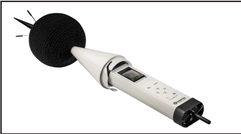
SV 307 - first ever class 1 noise monitor with MEMS microphone