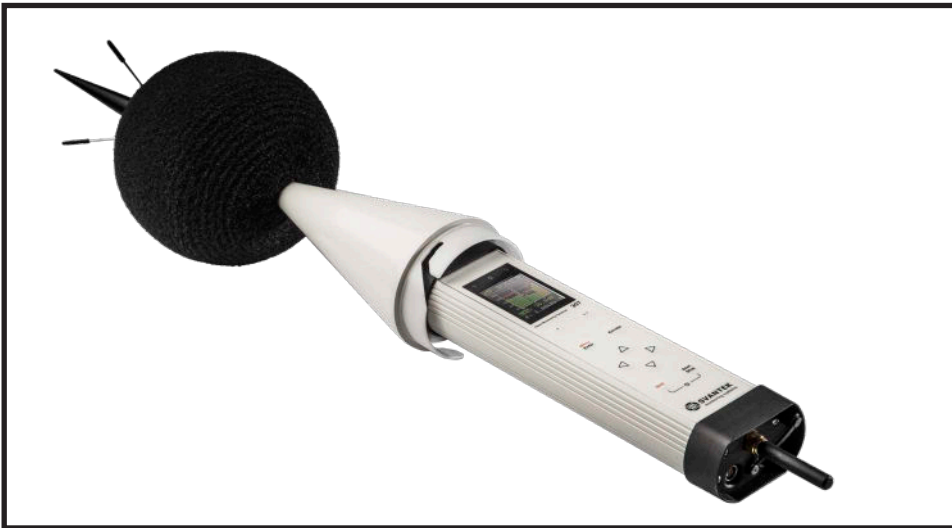
SV 307 - first ever class 1 noise monitor with MEMS microphone