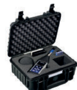
SA 72 Waterproof carrying case