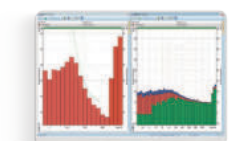
SF 971A_P1 Package 1/1 & 1/3 octave and audio recording