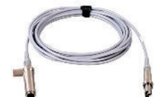
SC 91A Microphone Extension Cable