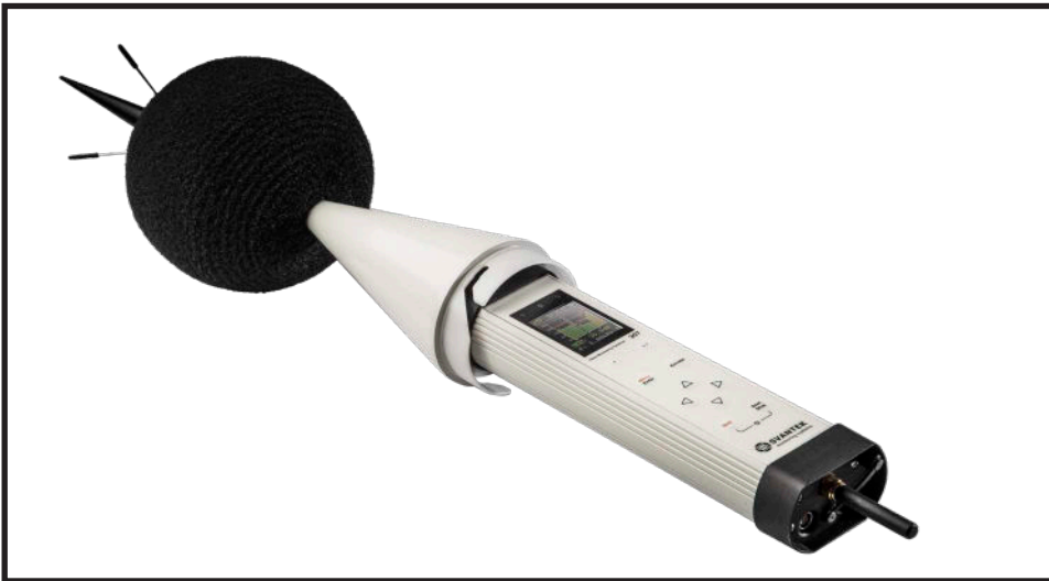
SV 307 - first ever class 1 noise monitor with MEMS microphone