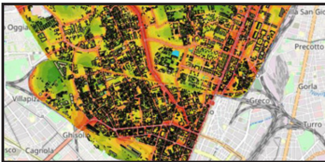
Example of dynamic noise map in city of Milan, Italy. Noise Exposure is updated every 30 seconds

Noise exposure of a population is currently one of the biggest problems in cities. High levels of noise cause serious health problems and even increase mortality. Noise management methods using static noise maps turned out not to be effective enough with this problem. Rapid development of remote communication and new technologies such as MEMS microphones moved the noise management into an on-line management system, a typical approach of smart cities management.