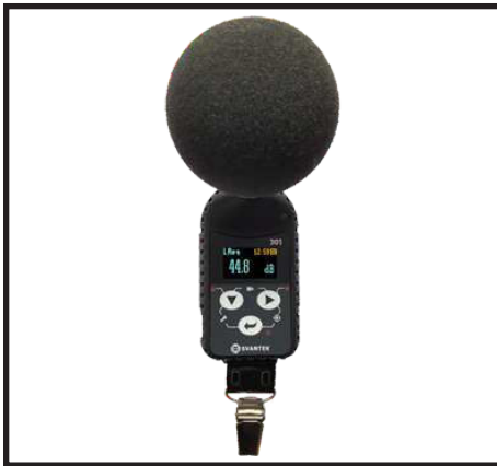
SV 301 – handheld noise monitor with MEMS microphone and Bluetooth connectivity

Management of noise pollution in function of the location is possible thanks to wearable noise meters, worn by public services around the city.