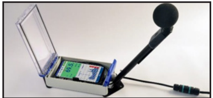
SV 302 – small stationary noise monitor with box for placing smartphone