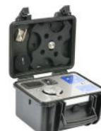
SV 111 Vibration Calibrator