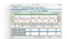
SvanPC++ EM Post-processing software