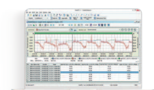
SvanPC++ EM Post-processing software