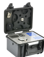
SV 111 Vibration Calibrator