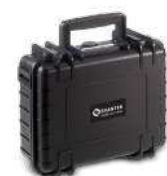
SA 147B Waterproof carrying case for dosimeter and docking station