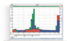
SF 100A_3OCT License of 1/3 octave