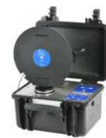
SV 111 Hand-Arm and Whole-Body Vibration Calibrator