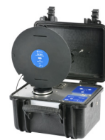
SV 111 Hand-Arm and Whole-Body Vibration Calibrator