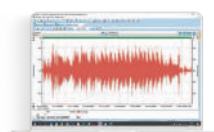
SF 100A_WAV License of audio recording