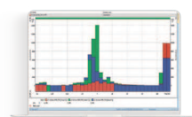
SF 100A_3OCT License of 1/3 octave