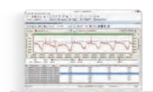
SvanPC++ EM Post-processing software