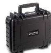
SA 147B Waterproof carrying case for dosimeter and docking station