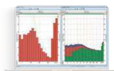
SF 104BIS_3OCT License of 1/1 & 1/3 octave