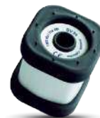
SV 34B Class 2 acoustic calibrator 114 dB at 1 kHz