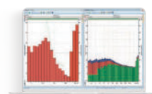
SF 104_30CT License of 1/1 & 1/3 octave